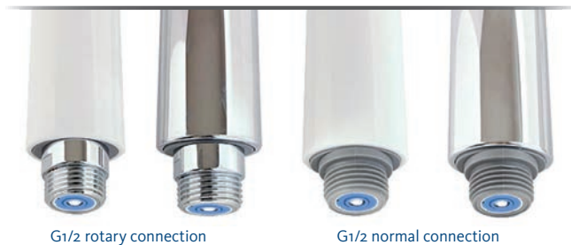
G1/2 rotary connection